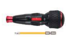
Electric screwdriver (cable bit 1set)