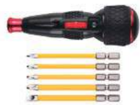
Electric screwdriver (adapter bits 5set)