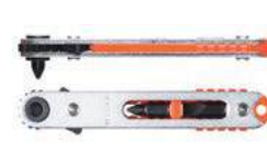
Flat-shaped Ratchet Screwdriver